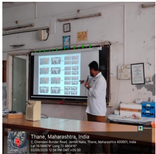
Thane, Maharashtra, India 2, Chendani Bunder Road, Jambli Naka, Thane, Maharashtra 400601, India Lat 19.188679° Long 72.980416° 02/08/2025 12:34 PM GMT +05:30