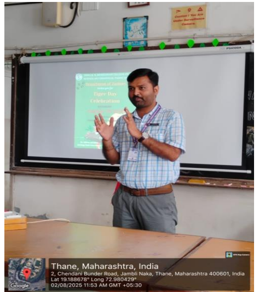
Thane, Maharashtra, India 2, Chendani Bunder Road, Jambli Naka, Thane, Maharashtra 400601, India Lat 19.188678° Long 72.980429° 02/08/2025 11:53 AM GMT +05:30