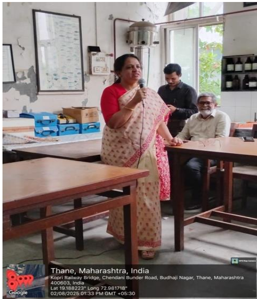
Thane, Maharashtra, India Kopri Railway Bridge, Chendani Bunder Road, Budhaji Nagar, Thane, Maharashtra 400603, India Lat 19.188622° Long 72.961718° 02/08/2025 01:33 PM GMT +05:30