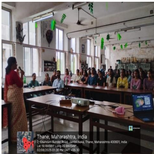
Thane, Maharashtra, India 2, Chendani Bunder Road, Jambli Naka, Thane, Maharashtra 400601, India Lat 19.188561° Long 72.980549° 02/08/2025 01:36 PM GMT +05:30