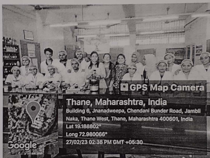
Students during practicals and theory

Graphical Representation of Feedback: The overall feedback is excellent.