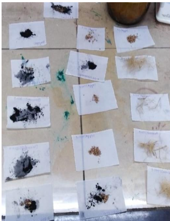
Picture (a): dried samples of Charcoal powder, apple peel powder, coconut husk powder

The adsorbent apple peels, coconut husk and charcoal were finely chopped and then apple peels and coconut husk dried in oven at around 109^{\circ}\text{C} (air dry) for around 2 to 4 hours. The different amount and different mixture of adsorbents were added to 2.00 ppm standard solution of NaF, as shown table no.2. The mixture was shaken vigorously and these samples were then allowed to stand overnight. These samples then filtered to get cleared solution. Then 5\text{ cm}^3 of reagent A was added to each flask. Then 25\text{ cm}^3 of distilled water was added to each flask. Shaked it well. After an interval of 10 minutes 5\text{ cm}^3 of reagent B was added to each flask and diluted with distilled water upto the mark and kept aside for 30 minutes in dark place. For these solutions the absorbance were measured at 530 nm and a calibration curve was plotted for concentration of fluoride ion versus absorbance measured.