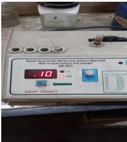
Picture (c): 100 cm 3 standard measuring flasks after dilution of fluorides solution (filtered from soaked adsorbent)