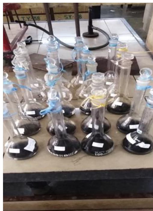
Picture (b): 100\text{ cm}^3 standard measuring flasks with adsorbent and fluoride solution before dilution